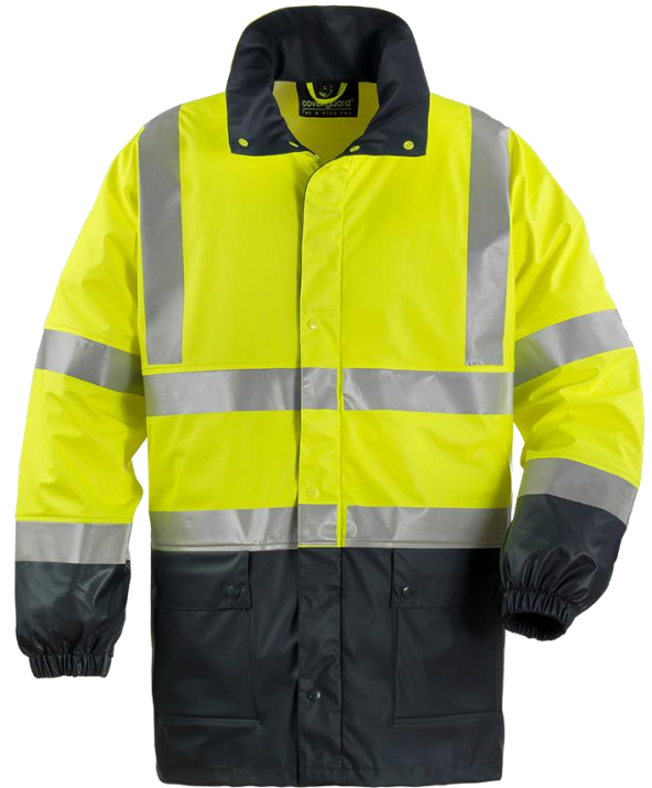
Yellow / Navy