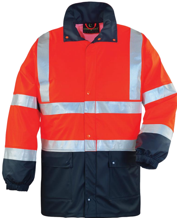
Orange – red/ Navy